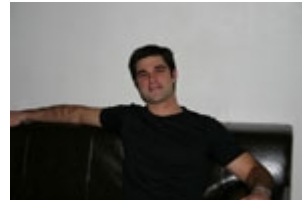
By Trent Brock

The minimum is 1,100 euros take home pay. Medical insurance is included. Three weeks of paid vacation are also included – two weeks for Christmas and one week for Easter.